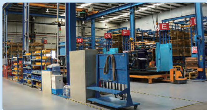
Oil injected screw compressors and refrigerant dryers plant: Pan-Asia, Wuxi